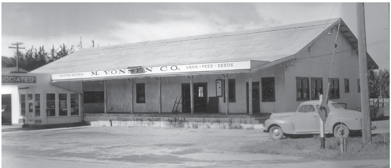
Two views, taken on the same day circa 1948. The service station section has been remodeled, but most of the remaining building possesses a high level of integrity.