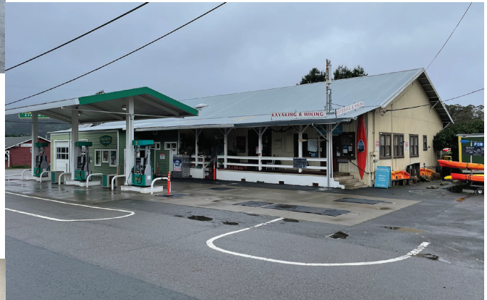
Historic window fabric and placement, January 21, 2024.