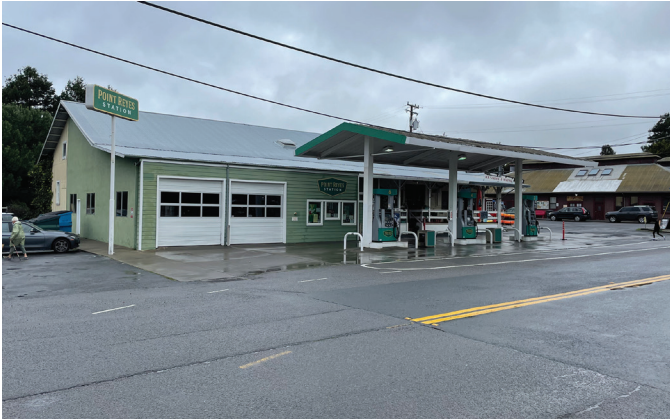
Property viewed to north, January 21, 2024.

Historical Integrity: Approximately 80% of the building's exterior possesses excellent integrity. It retains the original corrugated steel siding, windows, porch structure, roofline, and footprint. The west end of the building has been remodeled a number of times, but the footprint and general layout has not changed; only the surface fabric, and windows and doors of that section have been altered. It is this evaluator's opinion that the building possesses integrity despite the alterations of 20% of the building's exterior on the west side.